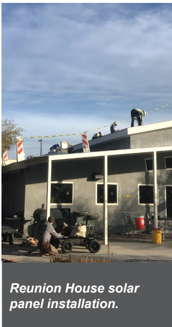
Reunion House solar panel installation.