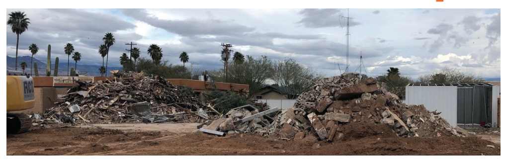
Demolition of the old Alvernon structure took place in early March to make way for the new Leonard Banes Campus. Construction is expected to be complete by Fall 2020.

To accommodate our direct services programs, staff will require not only office space but also many shared common rooms to allow for client meetings. In addition, staff frequently